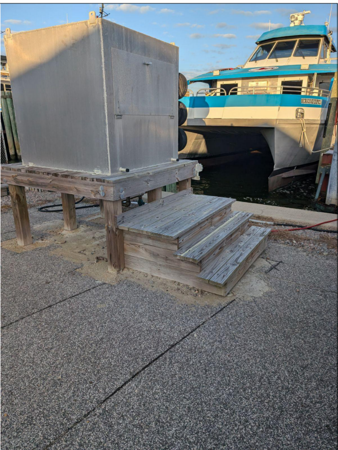
PHOTO 1 - EXISTING WATER BOX